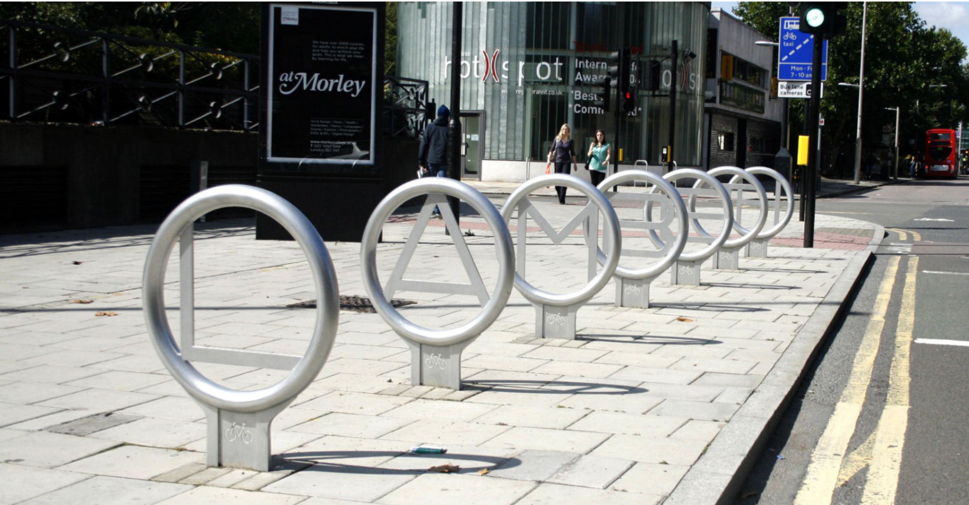
Lambeth Bike Rack