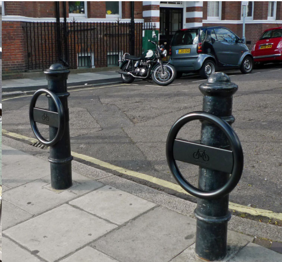
Railings and bollards